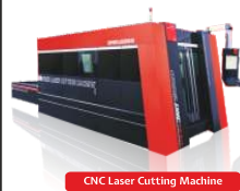
CNC Laser Cutting Machine

Skilled work force of professionals (Passion) Excellent IT infrastructure (Precision) We provide the best delivery schedules for fabrication of assemblies and Product Development using facilities like Demmeler Modular Fixtures and Multi-Axis Welding Robot (Simplicity)