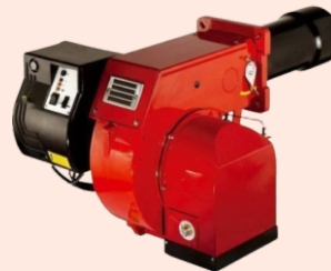
Oil/Gas Fired Burners