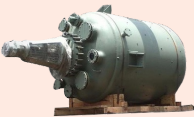
Reaction & Mixing Vessels