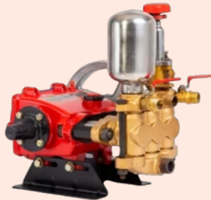
Water Feed Pump