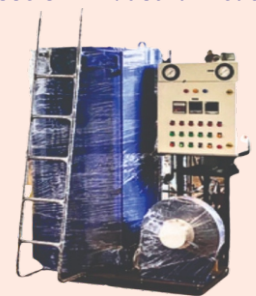
NON-IBR Steam Boilers